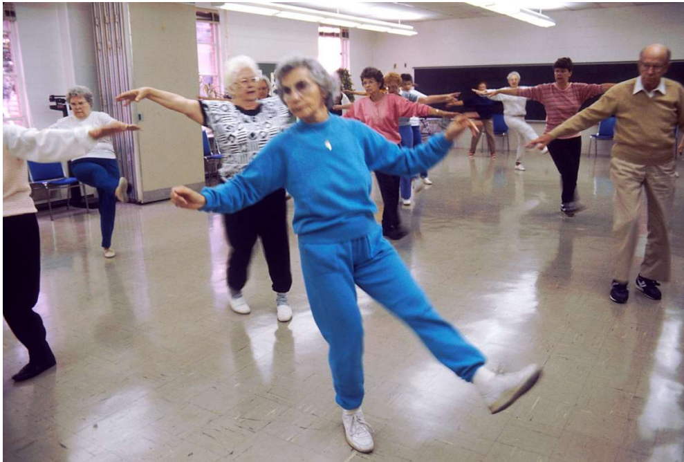
"OLD AGE IS NO PLACE FOR SISSIES" – BETTE DAVIS